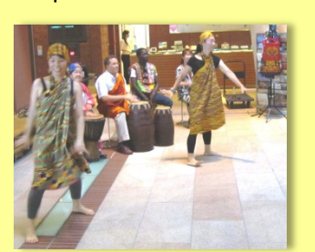
A dance performance by the African music group "Aha3de"

In Part 2, "African booths" were set up for children. They featured many summer holiday events such as making African instruments, trying on native dresses, picture book story-telling, playing African music and quiz competitions.