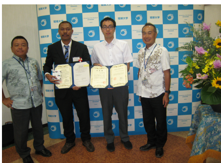
Graduation ceremony of Univ. of the Ryukyus in Long-term Participants course

Young Leaders from developing countries are also invited to Japan. The program aims at nurturing workforces responsible for future nation-building through programs in the fields required in their respective countries. Sessions of workshops are held with Japanese experts, professors, officers, and university students of the same background. It is a good opportunity for Japanese counterparts to deepen mutual understanding.