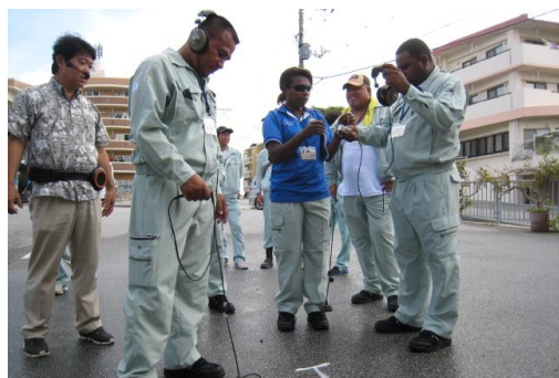
Water leak detection practice in Water Supply Services course