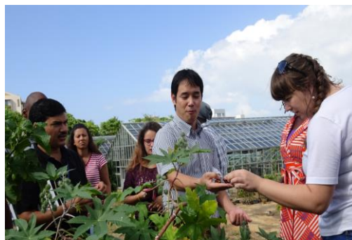
Jatropha’s seed investigation in Biomass course