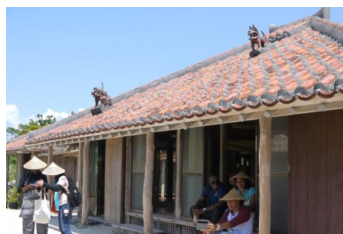
Home stay experience in Okinawan traditional house