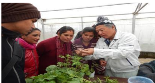
Vegetable Growing (Nepal)