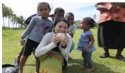
Nutrition Improvement (Fiji)