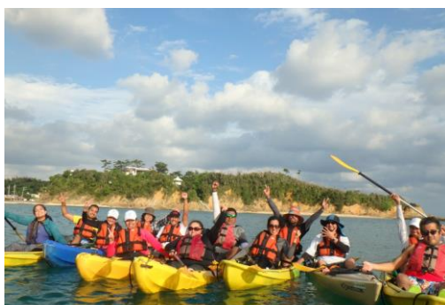
Kayaking experience in Eco-Tourism course

Utilizing Okinawa's strength as Archipelagic Characteristics, Subtropical Climate and Unique History and Culture, OIC carries out various programs. For example, there are programs in the field of Tropical and Subtropical Agriculture, Fisheries, Coral Reef Environmental Preservation, Health, Information and Communication Technology, Resource & Energy, Environmental Management, Tourism, Education and Transportation for island countries.