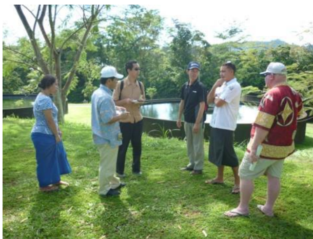
Water Supply Model Project in Samoa implemented by Miyakojima City

Various JPP projects are done in Okinawa that makes full use of the strength and uniqueness of subtropical archipelago.