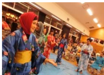
Yukata-clad participants join local festival.