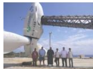
Progressive Energy Corporation Product: Tilttable Wind Turbine Country: Kingdom of Tonga