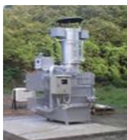
Tomas technical institute Co.,Ltd. Product: CHIRIMESER Country: Republic of Indonesia