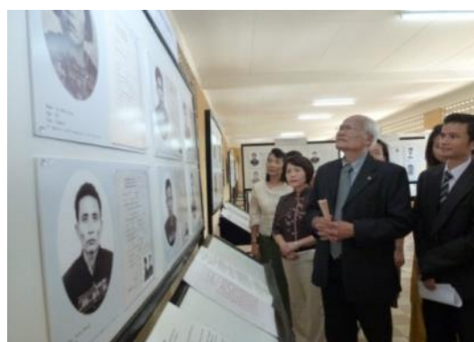
Okinawa-Cambodia Peace Culture Museum Cooperation implemented by Okinawa Prefectural Museum and Okinawa Peace Memorial Museum