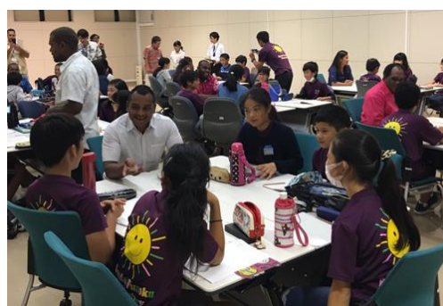
Intercultural experience class in Marine Ecosystem course