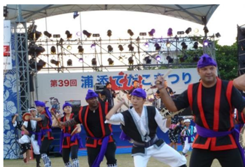
Eisa dance with local youth

Since its establishment in 1985, OIC has been welcoming more than 500 participants annually from Asia, Oceania, Latin America, the Middle East, Africa, and other regions. As of March 2016, 11,223 participants from 164 countries benefitted from OIC’s programs.