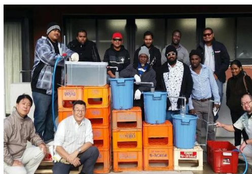
Making Bioremediation System in Water Environment course