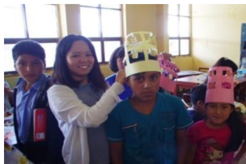
Protection of Cultural Properties (Peru)