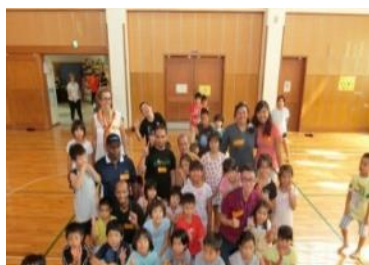
Friendship program with local children.

OIC promotes exchange programs between JICA participants and local communities through games, sports and joining local festivals. The programs deepen mutual understanding between Japan (Okinawa) and developing countries.