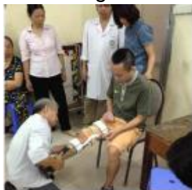
Sakima Prosthetics & Orthotics Co.,Ltd. Product: CB Brace Country: Socialist Republic of Viet Nam