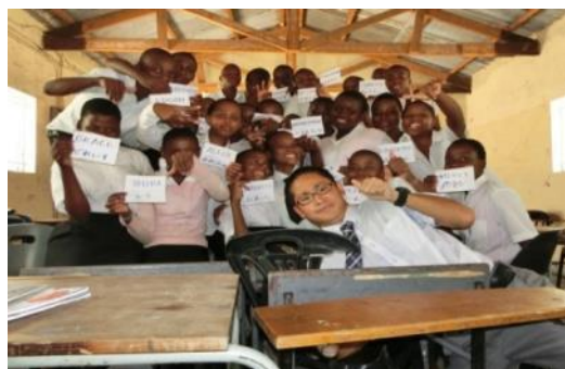
Mathematic Education (Malawi)

Dispatch of volunteers from Okinawa started 1968, totaling 461 junior volunteers and 67 senior volunteers until 2016.