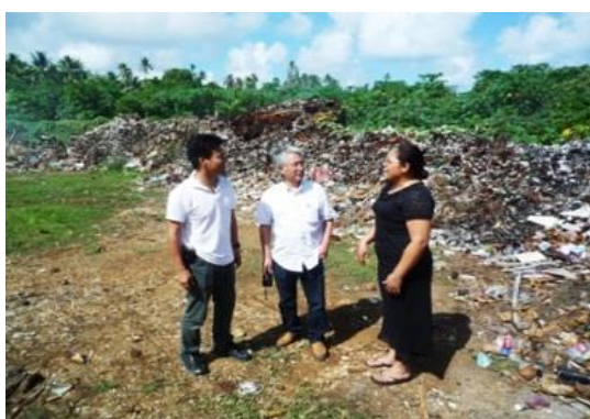
Hoi-An City's Solid Waste Minimization Project in Vietnam implemented by Naha City and Okinawa Citizen's Recycling Movement