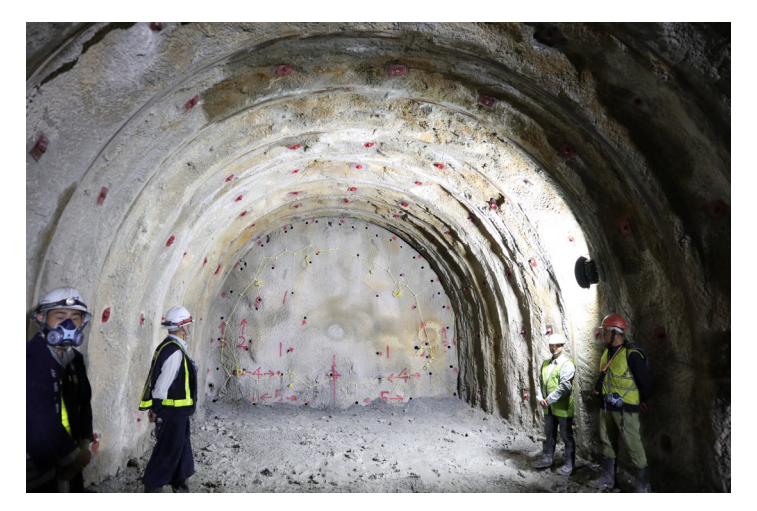
Nagdhunga Tunnel Evacuation Breakthrough before(left) and after (right)

'Nagdhunga Tunnel Construction Project' is the first of its kind in Nepal and its objective is to improve the road condition around Nagdhunga pass, thereby contributing to achieve the smooth transportation network and improve commercial activities between Kathmandu and other principal cities/areas in Nepal as well as abroad. The tunnel highway having two lanes with a total length of 2.7 km is expected to ease the traffic jam along the Nagdhunga-Naubise road section once it comes into operation. Likewise, it will also save time and reduce the consumption of petroleum products and reduce air pollution.