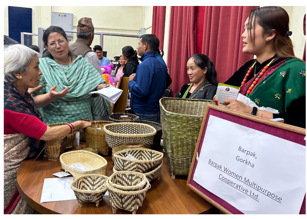
Business networking opportunities at the event

Many business representatives not only provided feedbacks for further improving designs and quality of the CRP products which were showcased at the venue, but also generously offered support in the form of marketing opportunities, training, and information sharing. The local government representatives also