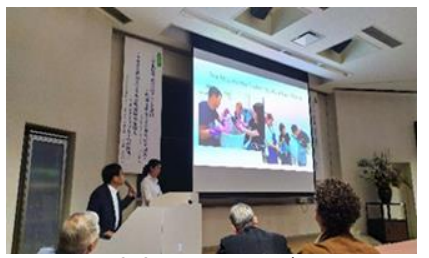
OVOP Kyrgyz Presentation.

On July 6th, 2019 the «One Village One Product» project and the Public Union «OVOP+1» took part in the International Aizome Forum (Aizome is traditional Japanese indigo color paint) organized by Shikoku University in Tokushima Prefecture.