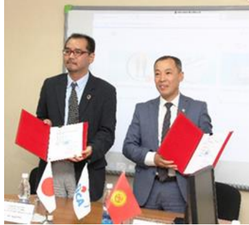
During the ceremony

On the 12th of July 2019 , the handover ceremony of equipment for the distance Education (DE) was held at the Training Center within the joint project of State Tax Service