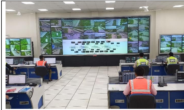
ITS Control Center