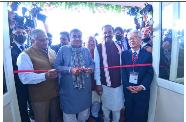
Ribbon Cutting for ITS Building