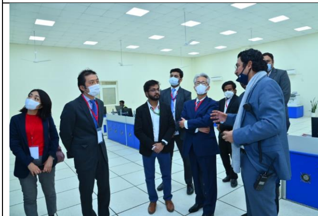
Review and Visit of Inside of ITS building