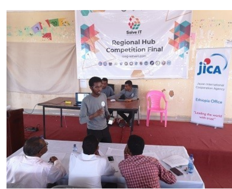
Presentations were made to judges in Jigjiga city (Their idea is to create an e-commerce platform for buying/selling a variety of products not only commercial products but also "service and data" etc.)