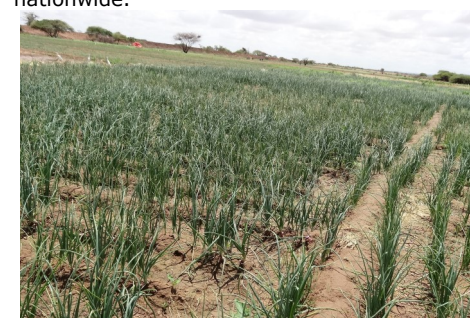
A smallholder farmer's plot. Such farmers will be the beneficiaries of index-based insurance.

It is expected that the project will insure 20,000 farmers within Oromia Region in the next five years. The long-term goal is for the Government of Ethiopia to scale-up and disseminate index-based crop insurance nationwide