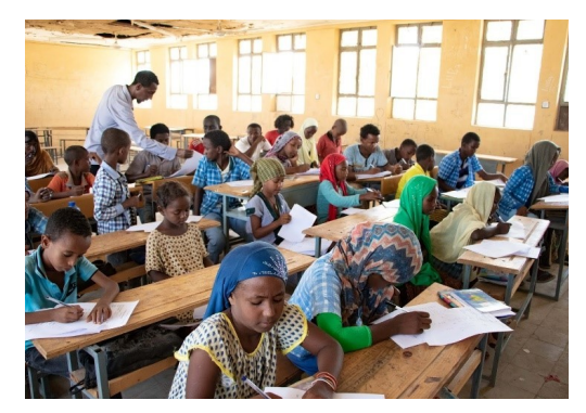
The JICA team conducted assessments of schools located in Afar region.