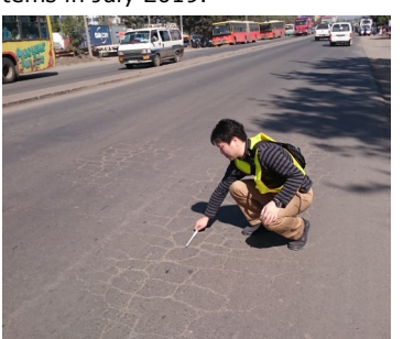
Japanese expert measuring road damage.

The capacity of AACRA staff has increased immensely during the duration of this project. JICA is confident that AACRA will sustainably continue to develop its capacity and serve as a model for other cities within Ethiopia, as JICA experts handover the systems in July 2019.