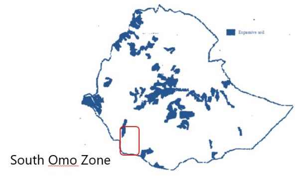
Map of Ethiopia showing areas with expansive soil.