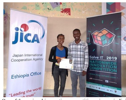
One of the regional innovation competition winners in Jigjiga city. (Their prototype is a hotel reservation management software, targeting low-mid level hotels)