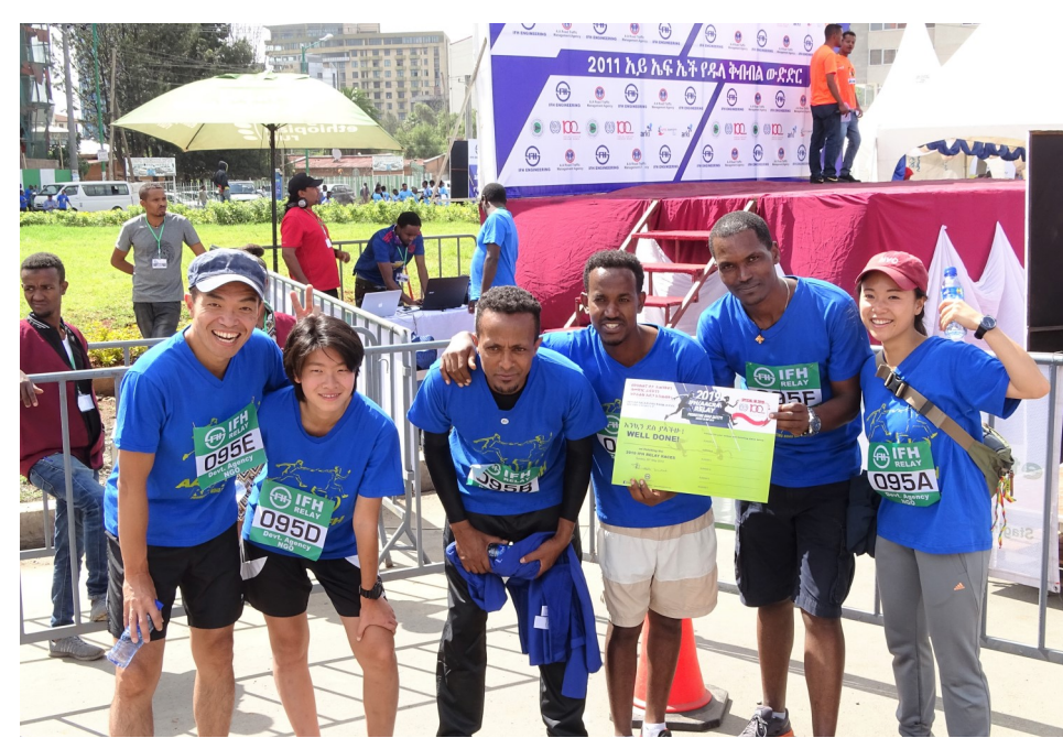
JICA staff participated in the annual AACRA Road Safety Awareness Relay Race on May 26, 2019.