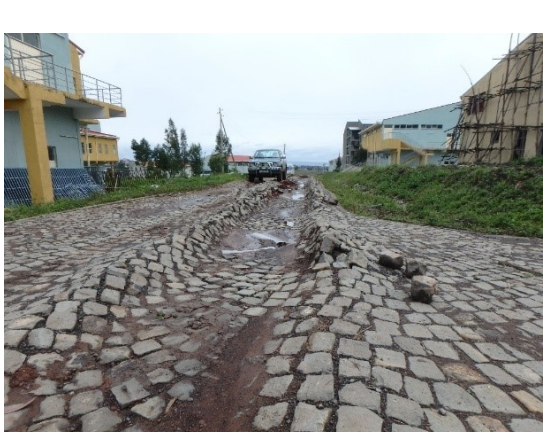
Distorted roads due to expansive soil