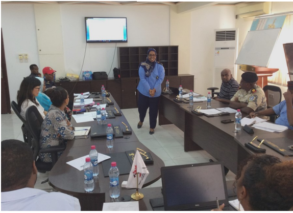
Basic Kaizen training session in Djibouti.

point JICA will host a national Kaizen workshop and award the best performing organization in the presence of high-level officials from Djibouti. We hope that the five selected organizations will serve as a model for others and will motivate the Djiboutian government and organizations to support the dissemination of the Kaizen philosophy nationwide.