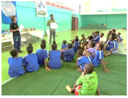
Lectures on first aid techniques.

These volunteers will be leaving Ethiopia in July; however, they expect that the first aid methods that they have shared will be practiced and shared with others in a sustainable manner.