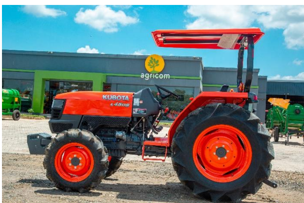
Photograph of Kubota's tractor in the Agricom Africa Ltd. showroom

DC70 is among the most popular combine harvesters in Tanzania because of its durability and efficiency, with few impurities being added when used for harvesting. The durability of a Kubota combine harvester is crucial to avoid breakdowns during the harvest season and to avoid impacting the capability of the machine. It is manufactured by the Kubota Corporation, the third largest agricultural machinery manufacturer globally. The local distributor of Kubota's machinery is Agricom Africa Ltd., which is based in Tanzania and also serves neighboring countries.