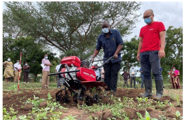
Photograph of the demonstration, wherein some of the participants experienced the operation of the tiller in the KATC farm field

a tiller equipped with a 6-hp gasoline engine, were impressed with the performance of the machine and stated, "I had some doubts about its ability to till deeply because of its small horsepower, but it works well." The machine is relatively small and easy to handle. Thus, women can operate it as well, and it is easy to use in small areas that a tractor cannot access.