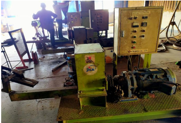
Photograph of Tromso's rice husk briquette machine introduced in 2017

The AFICAT team visited the Kilimanjaro Industrial Development Trust (KIDT) in Moshi to examine the rice husk briquette machines introduced by Tromso through a past JICA program. The units previously delivered are still in operation by technicians who were trained earlier, and husk briquettes are sold to government agencies, private companies, hospitals, etc., while devising maintenance measures, such as the local procurement of parts. The husk briquette machine is expected to contribute to the growth of job creation by adding value to the rice industry and to environmental conservation and decarbonization efforts by converting husks to fuel, which otherwise have no effective use.