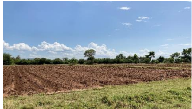
Photograph of a field in KATC. KATC has a wealth of resources, including agricultural machineries, human resources, and farm fields, due to many years of JICA support.

From mid-March to mid-May 2022, the AFICAT team conducted its first field activity in Tanzania, and discussed and agreed with the Ministry of Agriculture (MoA) and relevant agencies that AFICAT would be based at the Kilimanjaro Agricultural Training Center (KATC) under the MoA in Moshi, Kilimanjaro; each party was assigned roles and cost sharing under the AFICAT operation, and thus officially launching the activities of AFICAT in Tanzania.