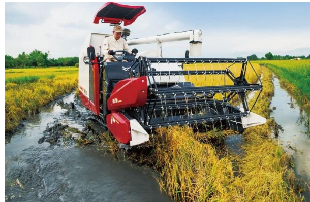
Photograph of YANMAR's combine harvester, YH700

features, such as the Maru handle, which enable smooth and comfortable operation of the machine, higher ground clearance that enables the machine to work in deep wet fields, double rotor mechanisms, and efficient and accurate sorting, with minor grain loss even in high-speed operation.