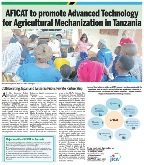
Image of the local newspapers, Mwananchi (in Swahili) and Citizen (in English), featuring activities of AFICAT, including Honda's on-site observation

[For more information on the newspapers]