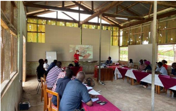
Photograph of the discussion between the Honda staff and participants in KATC

Thereafter, using the network established through the event as a foothold and with the support of the AFICAT team, Honda conducted a demonstration in the area under the Lower Moshi Irrigation Scheme at the end of May and is actively deploying local activities, including discussions with relevant organizations for future collaboration.