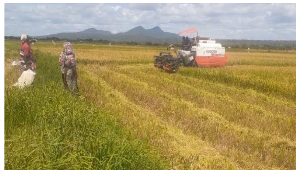
Kubota's combine harvester during training in Mombo

conducted training for agricultural machinery in Mombo, Tanga region, in May; the DC70 combine harvester was used for demonstration. Participants from the Ministry of Agriculture Training Institute (MATIs) and other institutes were invited to learn about the basic operations, safety measures, adjustments, maintenance, and handling of machine breakdowns.