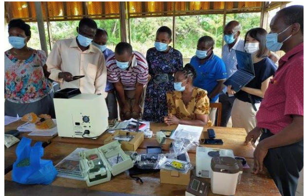
Photograph of the participants using the Kett products with the instruction of Kett staff via Zoom

In May, a seminar with an online demonstration was held for the local participants, which included one member from the MoA and ten from KATC, at the KATC facility, by connecting Japan and Tanzania via Zoom. Three types of grain moisture testers, one type of rice whiteness tester, one type of rice polishing (whitening) machine, and one type of automatic paddy husker were introduced and used for the demonstration.