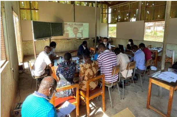
Photograph of the questions-and-answers session between the Kett staff in Japan and participants via Zoom